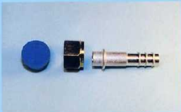
" O " RING FITTING